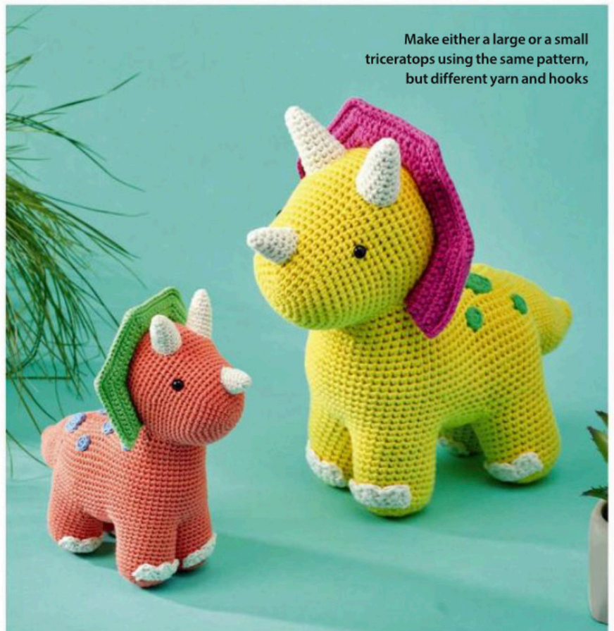
Make either a large or a small triceratops using the same pattern, but different yarn and hooks

Round 30 (Dc in next 4 sts, invdec) 6 times. [30 sts]