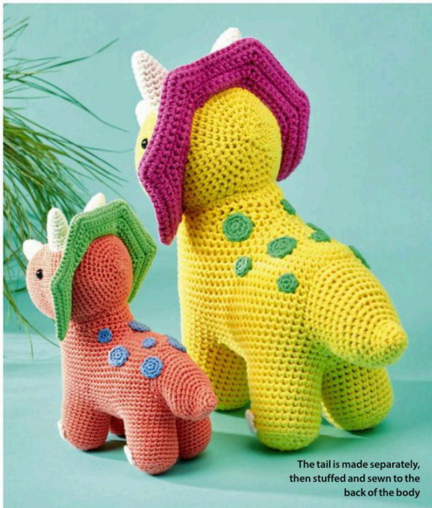
The tail is made separately, then stuffed and sewn to the back of the body