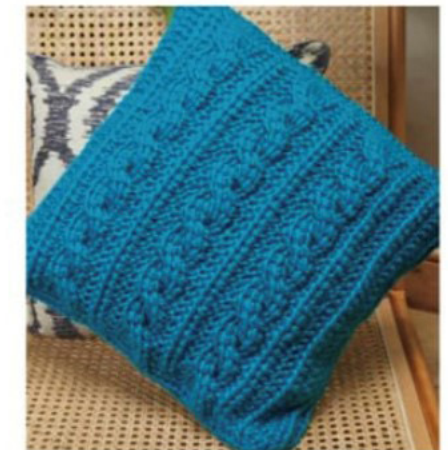
Cables are worked over six stitches, crossing three stitches either in front or behind