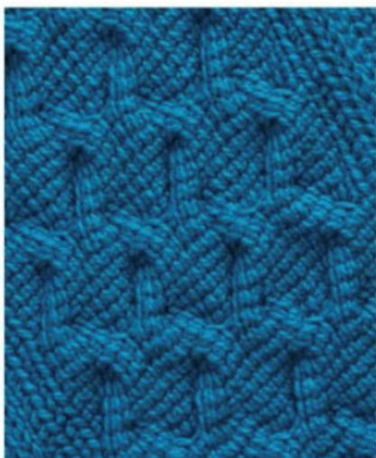
The complex pattern is comprised of several sections of interspersed cables and lattices