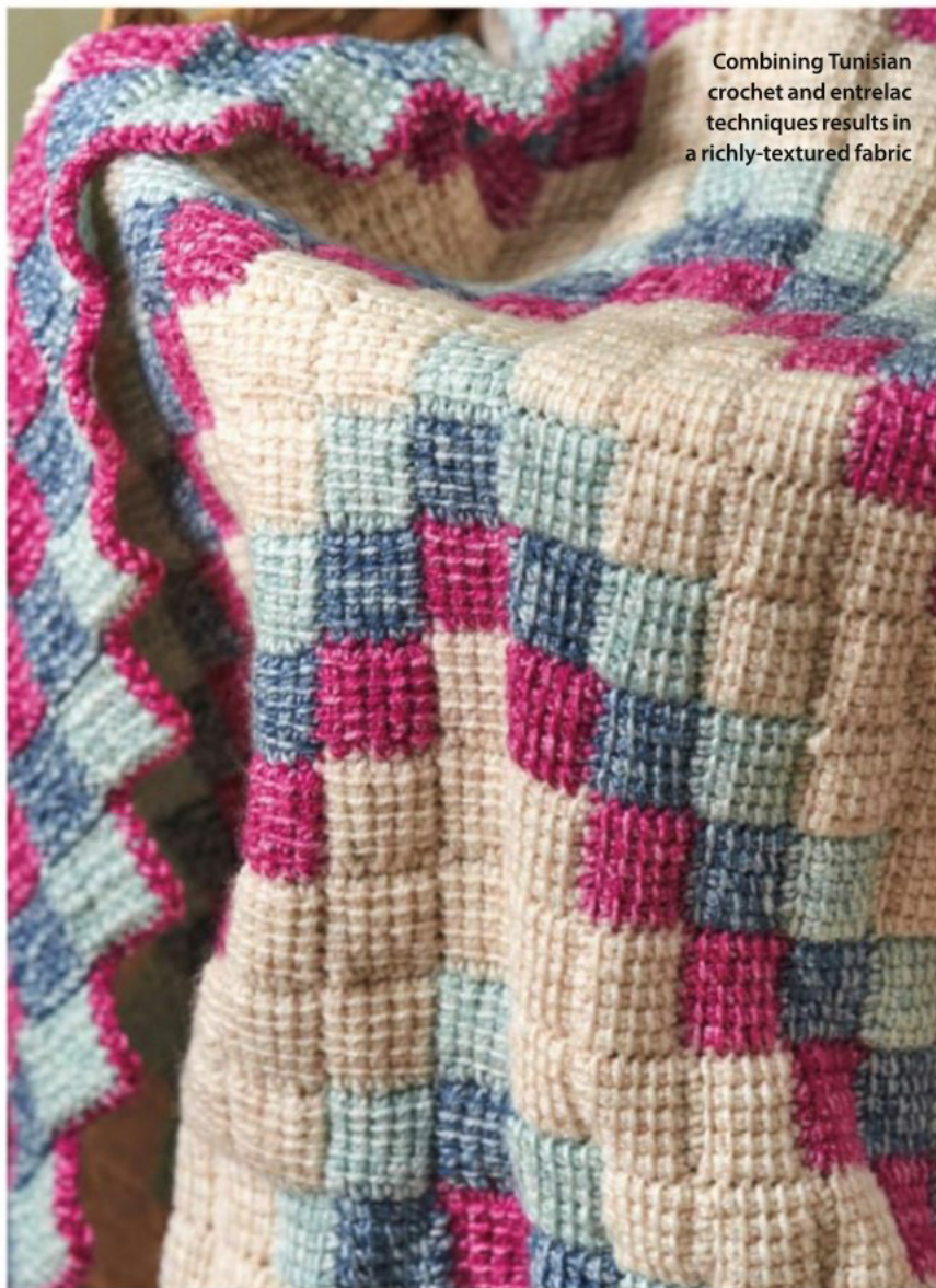
Combining Tunisian crochet and entrelac techniques results in a richly-textured fabric