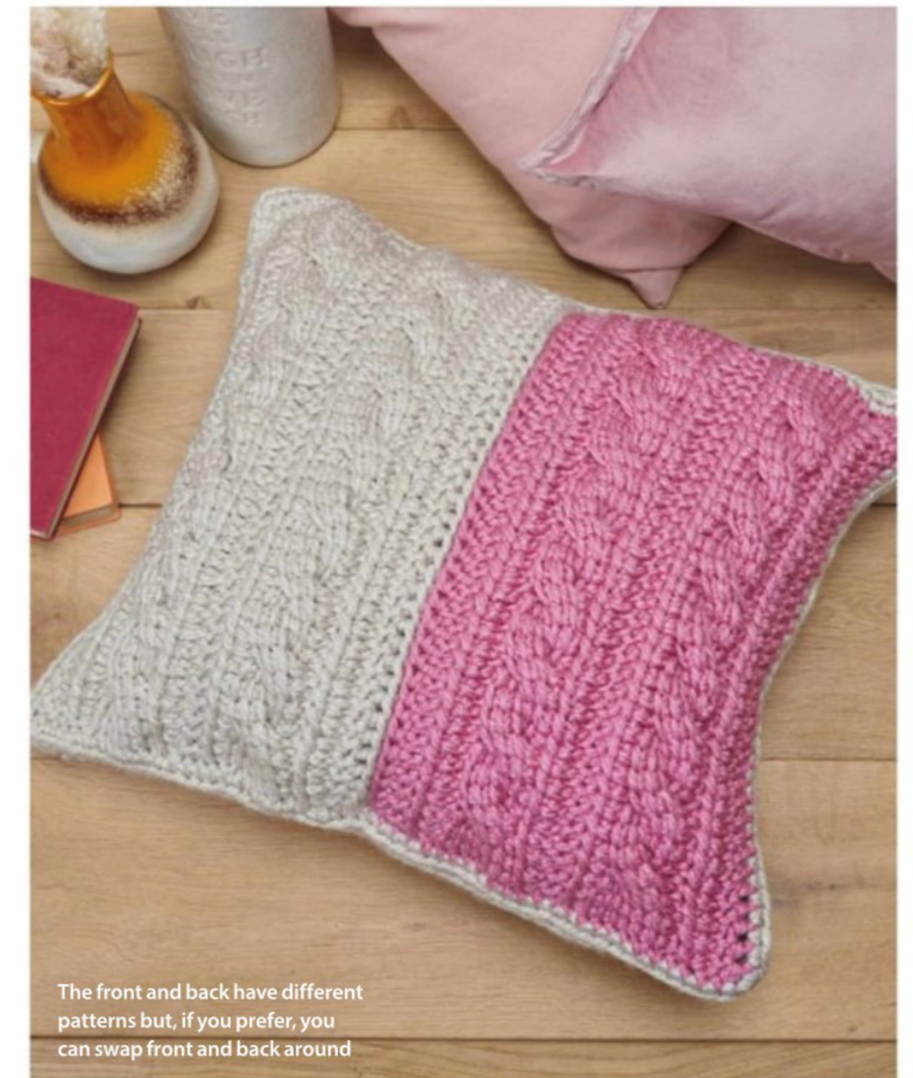
The front and back have different patterns but, if you prefer, you can swap front and back around

Using a 10mm Tunisian hook and Parchment, ch30. Row 1 (RS) Insert hook in bl of second ch from hook, yrh and pull up a loop, leave loop on hook, (insert hook in next ch, yrh and pull up a loop) 28 times (30 loops on hook), RetP across. [30 sts] Row 2 (Tps in next 2 sts, LC) twice, Tss in next 12 sts, (LC, Tps in next 2 sts) twice, Tss in final st, RetP across. Rows 3-4 Repeat Row 2. Row 5 (Tps in next 2 sts, LC) twice, C6B over next 6 sts, C6F over next 6 sts, (LC, Tps in next 2 sts) twice, Tss in final st, RetP across. Place stitch marker at beginning of this cable row. Rows 6-8 Repeat Row 2 Row 9 (Tps in next 2 sts, LC) twice, C6F over next 6 sts, C6B over next 6 sts, (LC, Tps in next 2 sts) twice, Tss in final st, RetP across. Place a different stitch marker at beginning of this cable row.