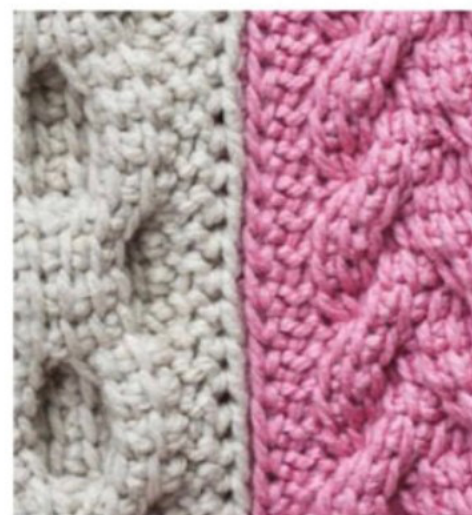
Join the rectangle strips with a slip stitch seam with the wrong sides facing you