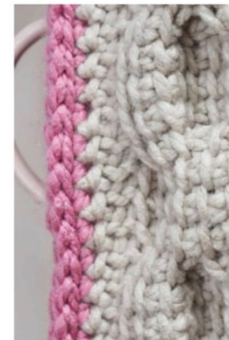
Work a one-round border in double crochet all around the outside to finish the blanket