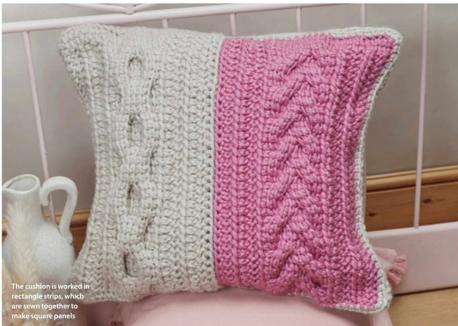
The cushion is worked in rectangle strips, which are sewn together to make square panels